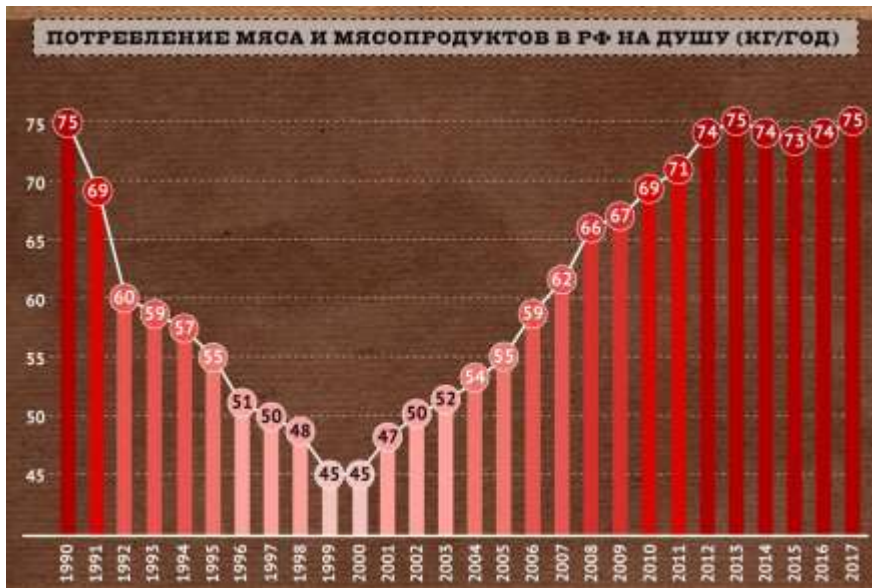
Figure 5. Per capita meat consumption in Russia