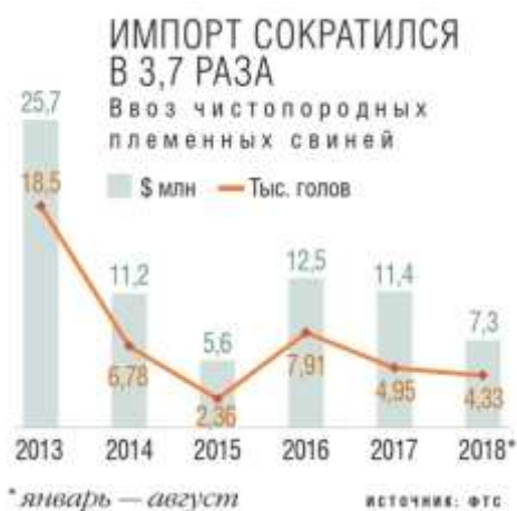
Figure 2. Hog Imports over the Period 2013-2018, thousand head

Source: Federal Customs Service ( http://customs.ru/ )