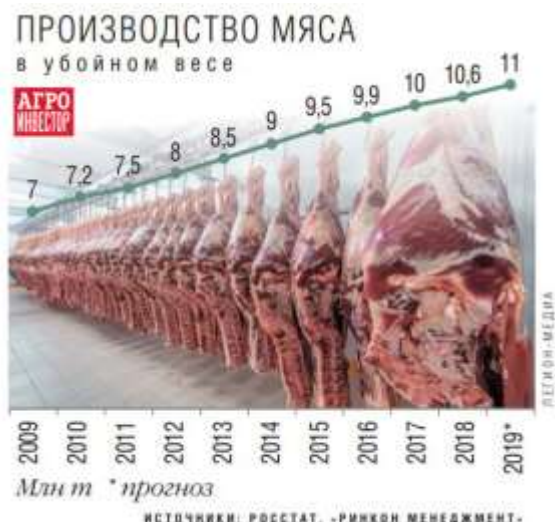
Figure 1. Meat Production over the Last Decade million tonnes