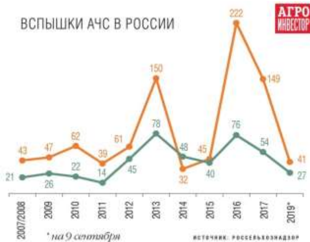
Figure 6. Outbreaks of ASF in Russia over 2007-2019

Source: Rosselkhoznadzor ( https://www.fsvps.ru/ ) *January-September 2019