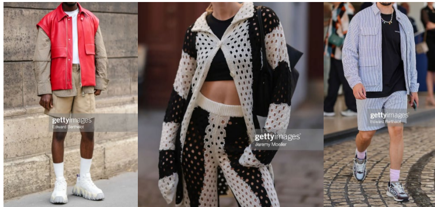
The Desert Rider, The Coastal Explorer, The Summer Enthusiast.

All three of these sub-trends are undoubtedly influenced by the overall trend of nature and outdoor living – yet all having their own unique element of something in nature. Nature and outdoor living were a big trend in AW 22, and is still evident in the SS 23 season, as consumers are still seeking to connect with nature and the ‘real’ things in life again post-pandemic. Perhaps this is a trend that is here to stay.