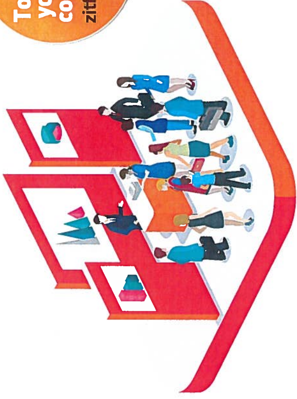
Exhibit at ZITF 2018,

To book your stand, contact us zitf@zitf.co.zw